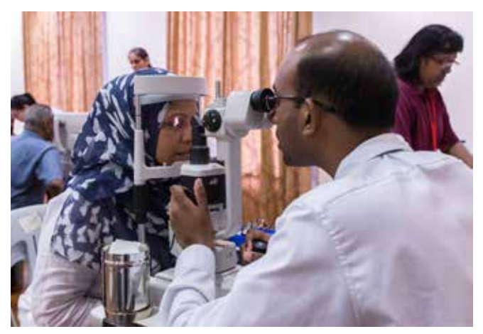
Going for a perfect score in eyesight