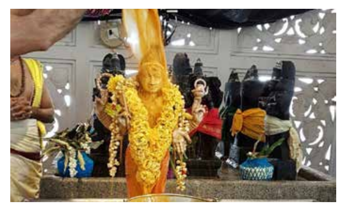
Special abishegams for Sri Guru and Sri Navagrahams during Guru Peyarchi on 2 August 2016