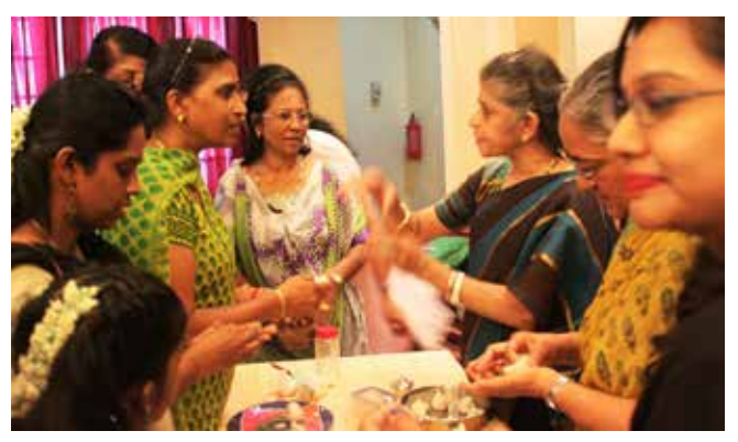
Participants trying out modakam making