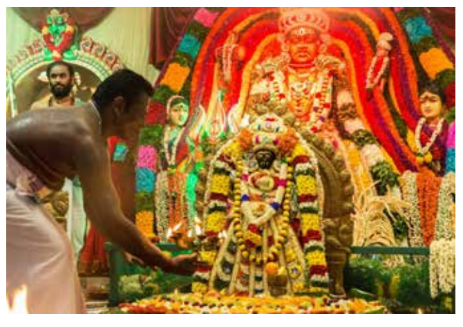
Sri Periyachi Amman Poojai was conducted on 7 August 2016 as a prelude to the all-important Kodiyetram for the annual Fire Walking Festival (Theemithi) which falls on Sunday, 23 October 2016