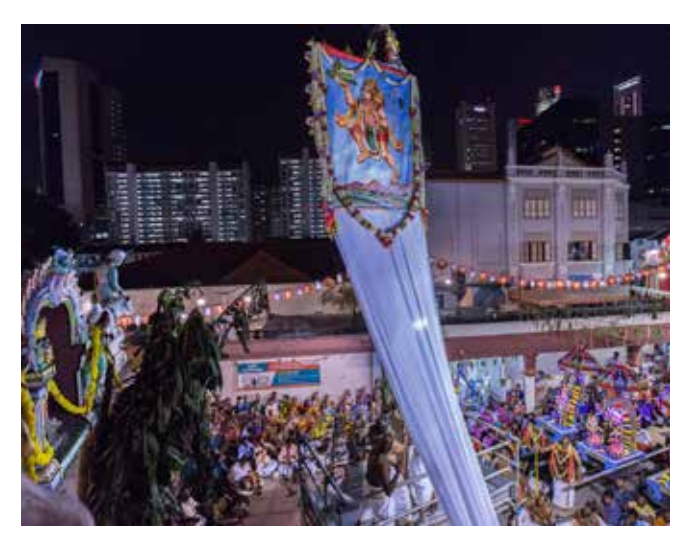
Sri Drowpathai Amman Kodiyetram drew a large crowd as it fell on the eve of National Day this year