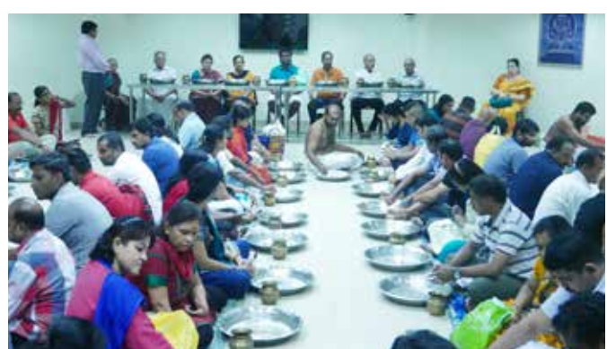
More than 1000 devotees performed Tharpanam on Aadi Amavasai at Sri Sivan Temple. Special arrangements were made to accommodate the elderly and Annathanam was served to devotees all-day.