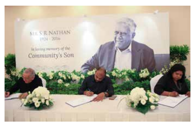
Guests signing condolence books