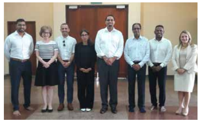
Temple management committee members with the delegation from USA

The Sub Saharan Africa High Level Ministerial delegation visited the Temple on 22 August 2016. Both delegations were given an introduction of the Temple and its history, and a video presentation of Fire Walking Festival.